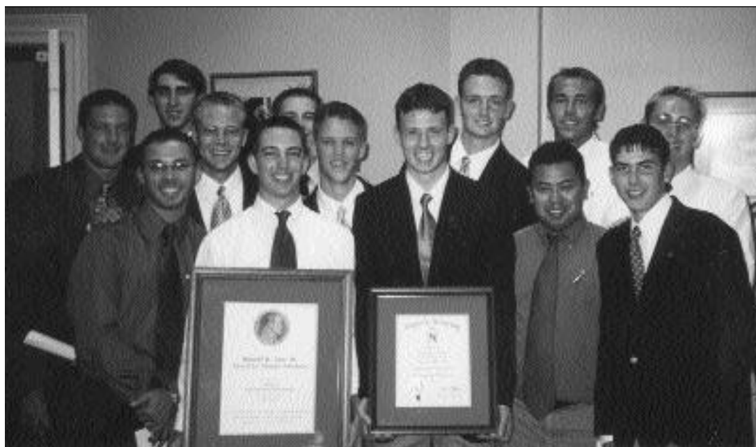
Brothers of Iota Beta with the Alter Award.

Epsilon Xi - Clarion University of Pennsylvania Epsilon Phi - Central Missouri State University Zeta Beta - Adrian College Zeta Beta - Adrian College Zeta Gamma - University of Alberta -0Zeta Epsilon - California State University- Long Beach Zeta Kappa - Ohio Northern University Zeta Lambda - Westminster College Zeta Xi - University of California - Davis Zeta Sigma - University of Wisconsin-River Falls Zeta Upsilon - University of Hartford Eta Beta - Eastern Kentucky University Eta Zeta - Edinboro University Eta Kappa - James Madison University Eta Pi - East Stroudsburg University Eta Tau - California State University - Stanislaus Theta Epsilon - Kennesaw State University Theta Eta - Sam Houston State University Theta Iota - University of California-Santa Cruz Theta Kappa - Texas Tech University Theta Mu - California State University - Hayward Theta Xi - Virginia Commonwealth University Theta Rho - McNeese State University Theta Sigma - University of California - Santa Barbara Theta Tau - Western Michigan University Theta Psi - University of Wisconsin - Oshkosh Iota Alpha - University of North Carolina - Wilmington Iota Beta - Southwest Missouri State University Iota Gamma - Grand Valley State University Iota Delta - Southeastern Louisiana State University Georgia State University Colony