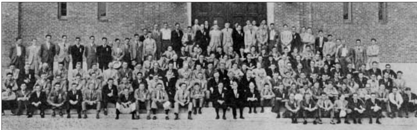
Men of Theta Chi at the 75th Convention. Will you be on these same steps of the Norwich University Armory in the Summer of 2006? Will you help fund some of the special programs envisioned for the Sesquicentennial of Theta Chi Fraternity?