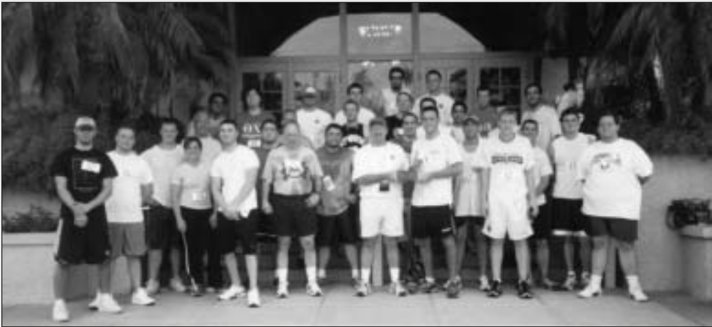
Participants in the 2004 Freeman-Chase.