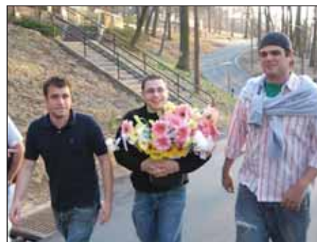
Brothers from Beta Sigma/Lehigh participated in a "Take Back the Night" walk to take a stand against sexual assault on campus.

Members of the Eta Gamma Chapter of Theta Chi Fraternity at Morehead State University helped the Morehead Lions Club with its annual fundraiser rummage sale on Saturday, Oct 7, 2007. The Lions Club uses money it raises at the yard sale to help pay for eyeglasses and eye exams for those who qualify. It also donates to many international, national and local causes.